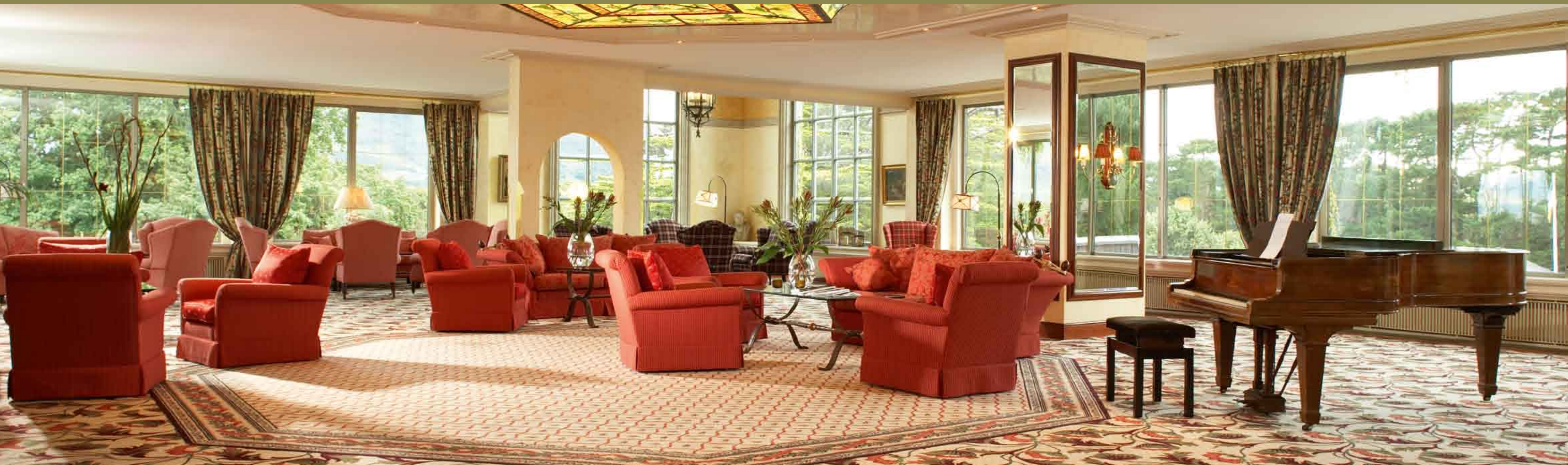
The Upper Lounge – Relax and Unwind in Style