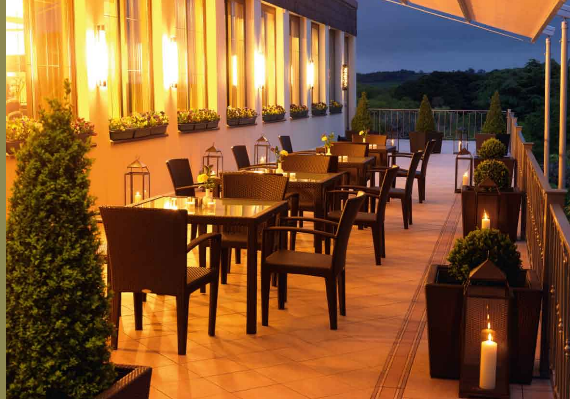
The Park Suite Terrace